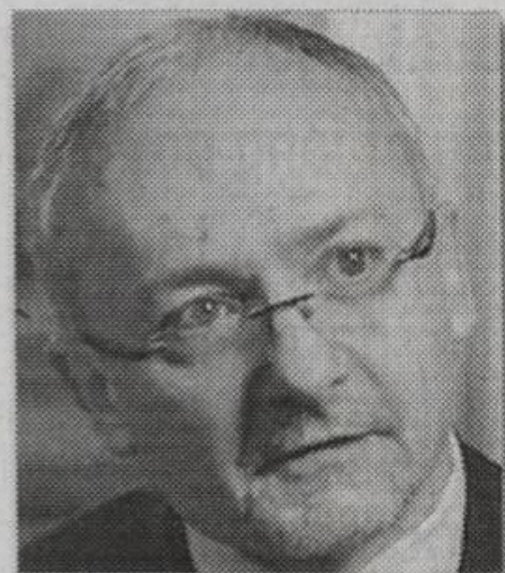
Claudio Borio Chief, Bank for International Settlements

Since we have decided to temporarily call off the strike, all the showrooms will be opening immediately. Today, there is a meeting of the association members in Mumbai. We will be deciding our next course of action there